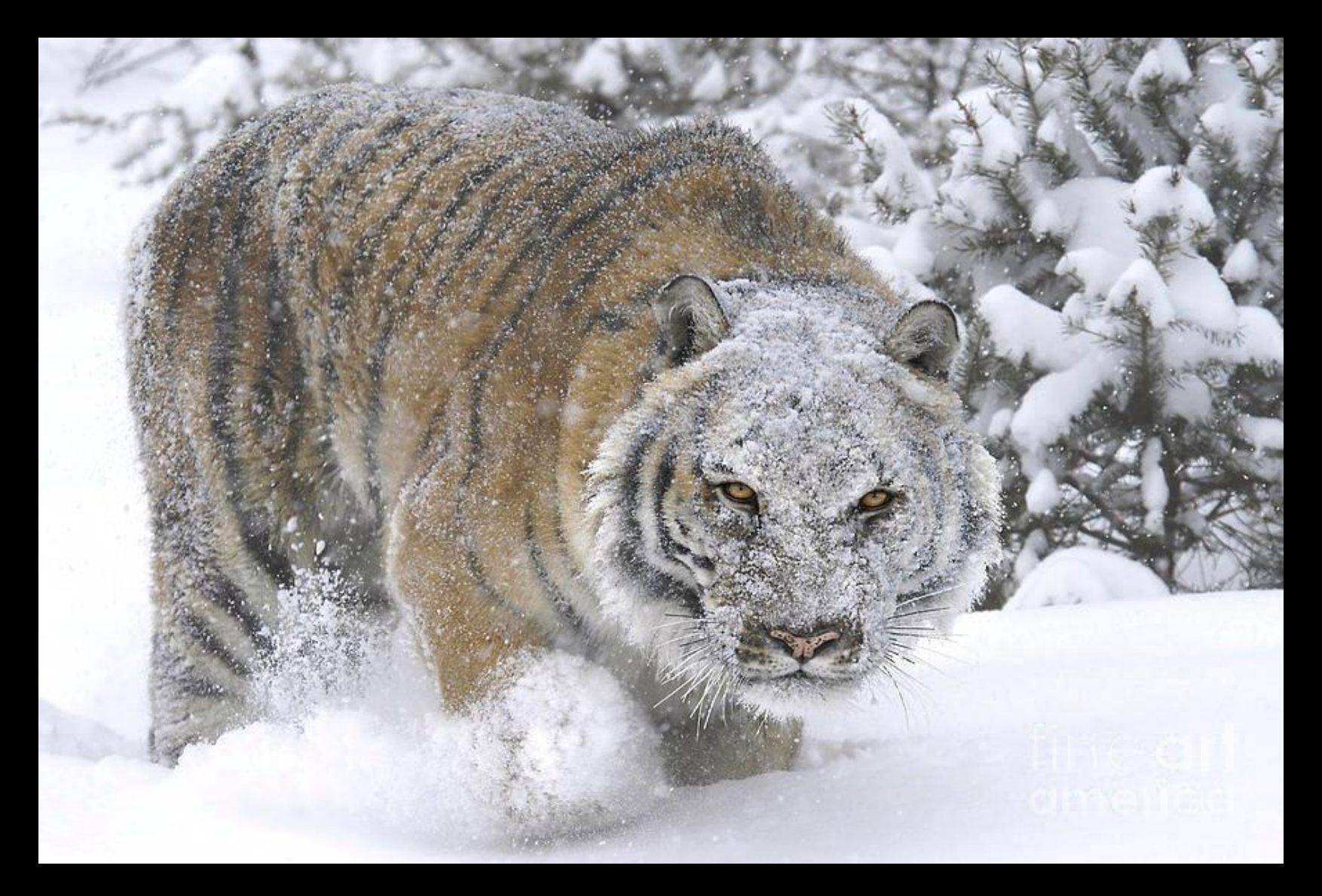
Screenplay Coverage: Blue Cat Screenwriting Competition