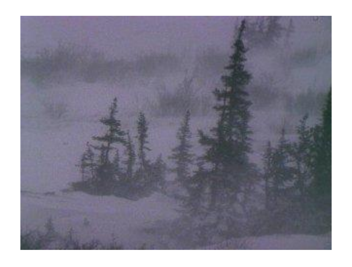
What if you were forced to flee from the Mafia into the unforgiving terrain of Siberia?